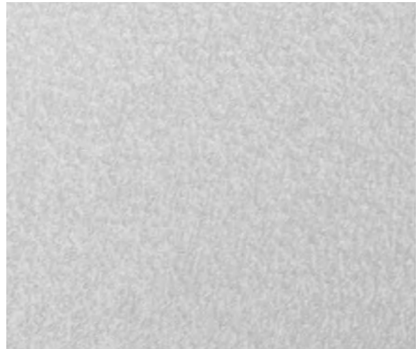
S81 Stipple Pattern