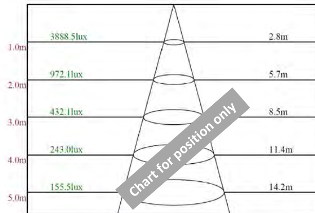
Beam angle of C90plane109.74