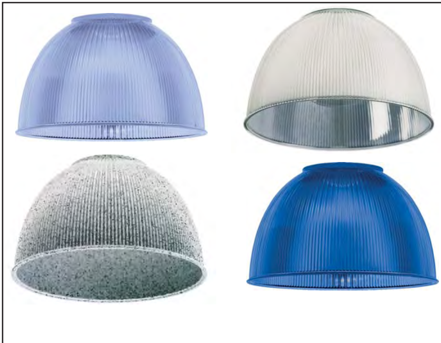
Acrylic Pearlescent Blue, Acrylic Metalized, Molded Granite, Vibrant Blue.