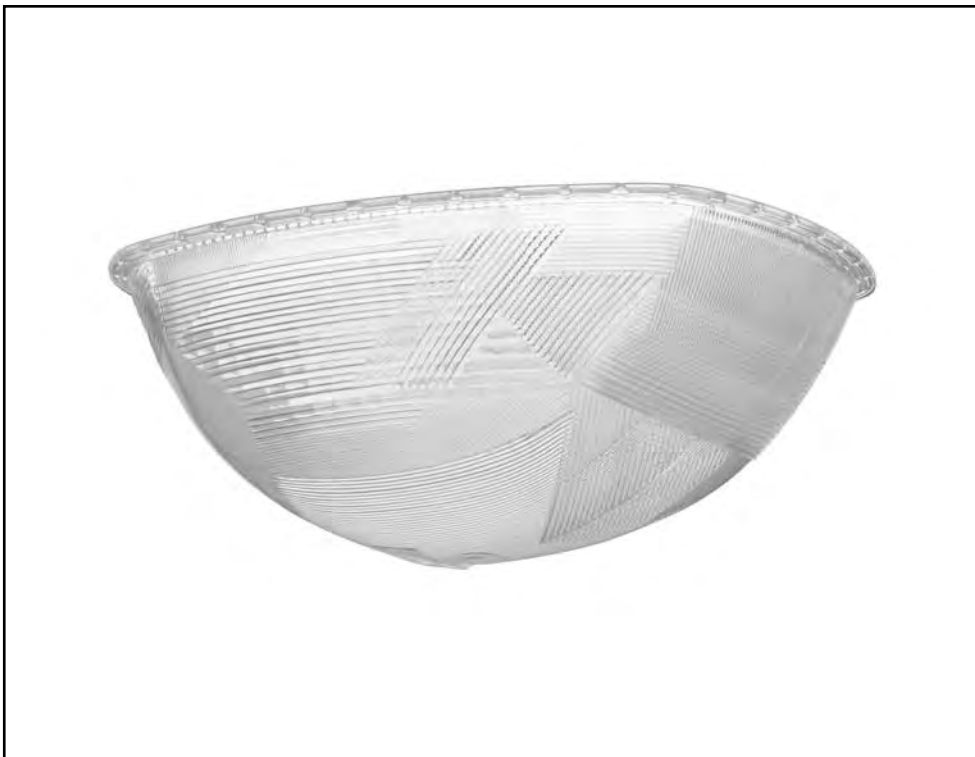
Model 340 Type III