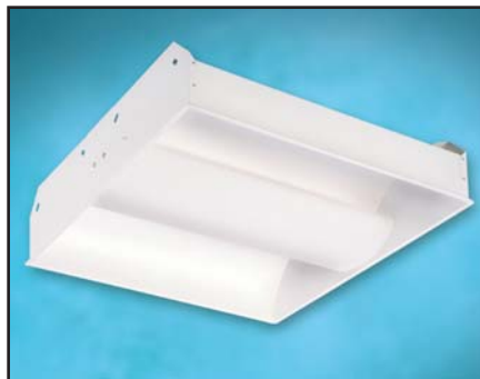
RDI Recessed Direct / Indirect